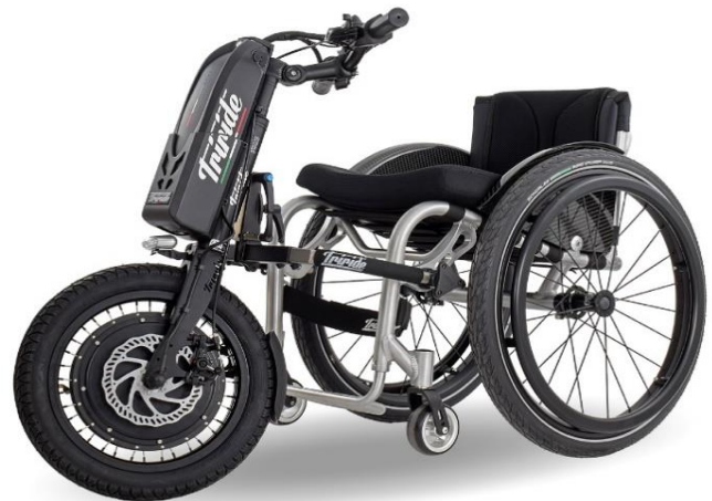
16" wheel with spokes