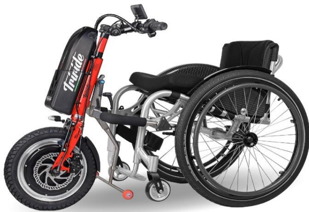
14 " wheel with integrated motor